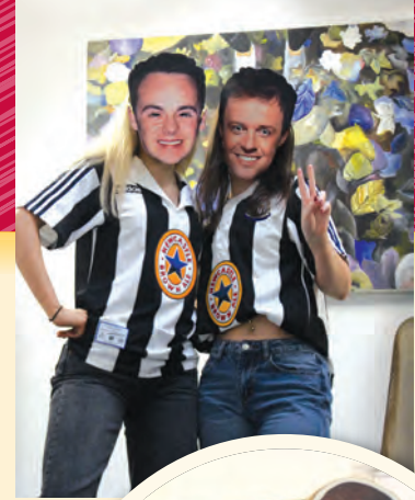
Sixth Form girls dressed as Ant and Dec.